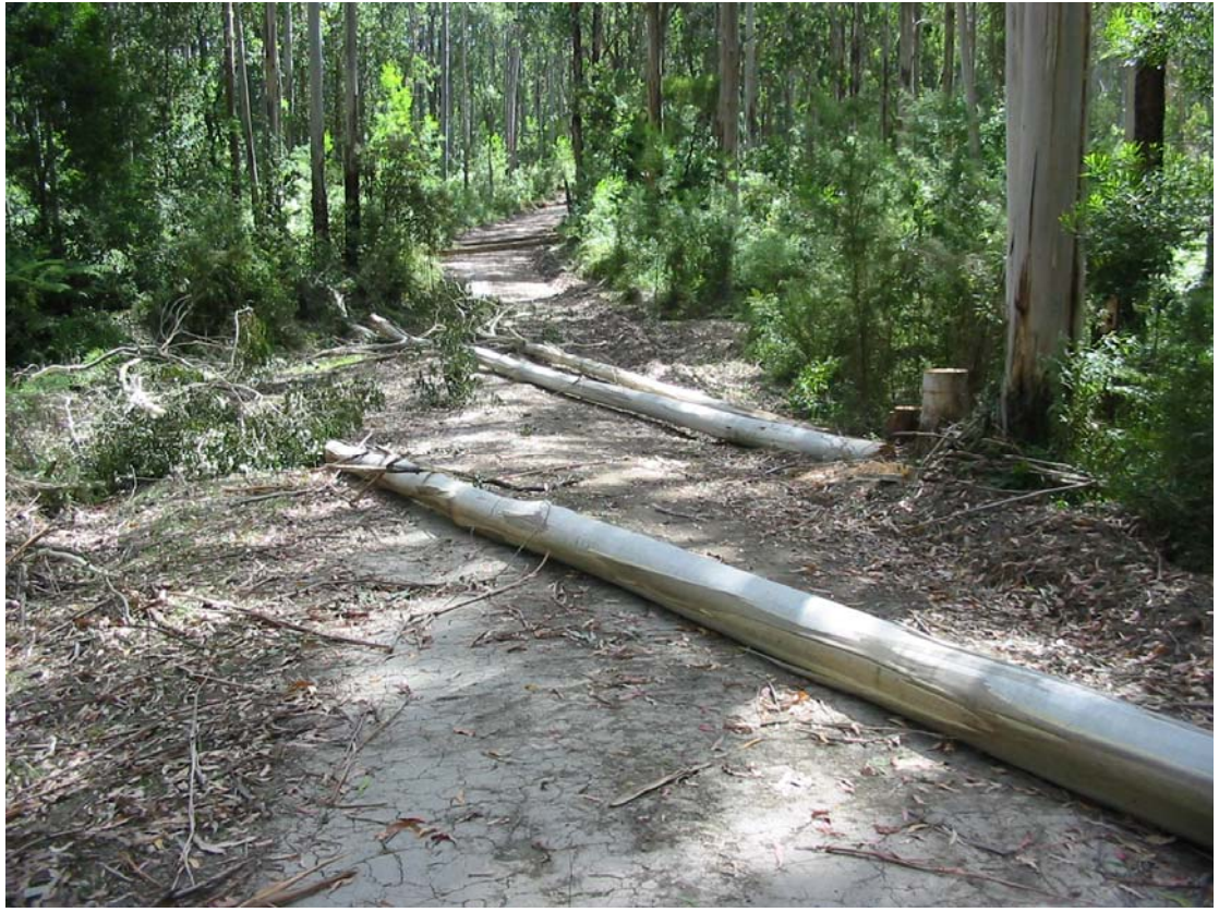
Trees felled onto Link track to prevent vehicle use after bridge was constructed. Jan 03.