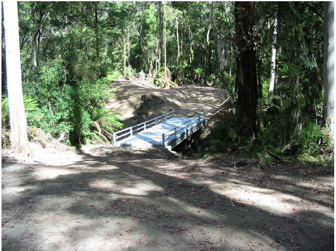
Small clearing on south side of Link Track Bridge that was constructed so logging could occur in Arkins Creek catchment. Jan 2003

The photos below show the Link Track area.