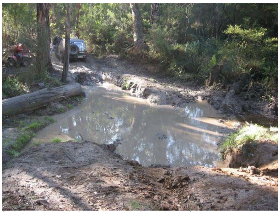
Creek crossing in what looks like heath type country, claimed to be in the Otways. Note the clear fresh water flowing from the right into muddy pool, compared with the muddy water flowing down on the left.