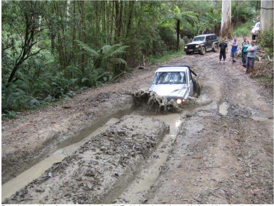
People watching the spectacle of a 4WD driving through mud hole, claimed to be in the Otwayshttp://www.bellarine4x4club.org.au/gallery/main.php?g2_itemId=3537