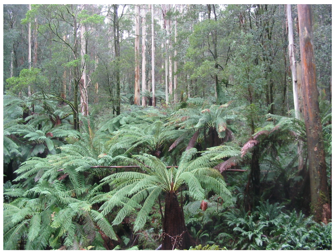
General condition of understorey that would have to be destroyed to build 4WD camping ground. June 04.